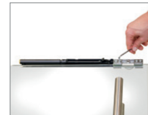
2. Installation of the roller carriage using only one Allen key