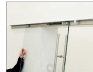
3. The door leaf is inserted into the track from the front