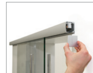
6. Side-cap insertion