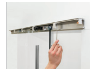
4. Mounting the clip-on cover bracket using the same Allen key