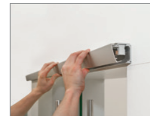
5. Clipping the clip-on cover