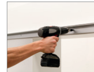
1. Attachment of the track from the front

You can find more information under: www.geze.de/Levolan-60 www.geze.de/Levolan-120