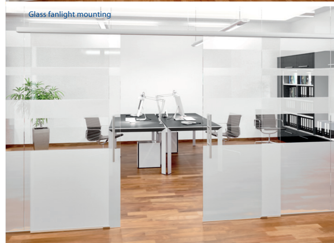
Glass fanlight mounting