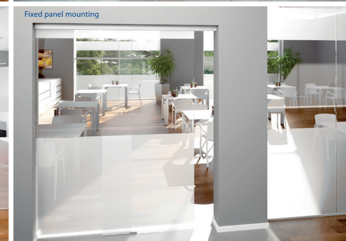
Fixed panel mounting